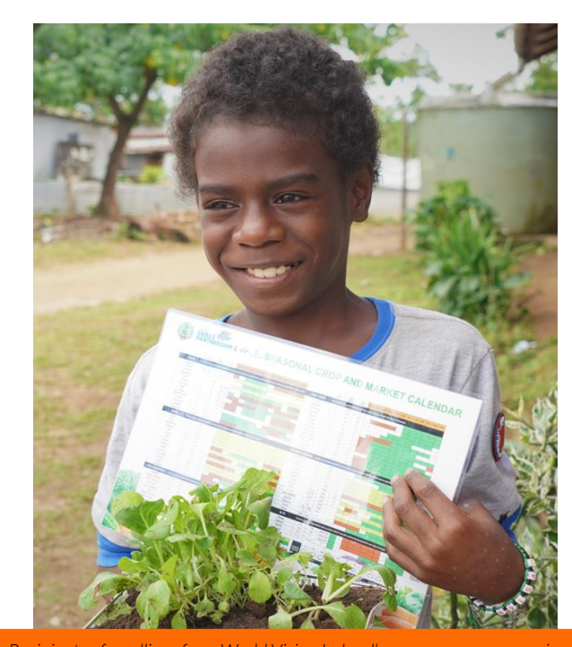
Recipients of seedlings from World Vision Ireland's emergency response in Urban Port Villa, Vanuatu to help their recovery following tropical cyclones Judy and Kevin in March 2023

We responded to emergencies in 13 countries, reaching 361,756 people including 199,537 children