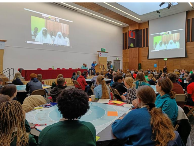
Youth attending a Youth Climate Assembly in Galway